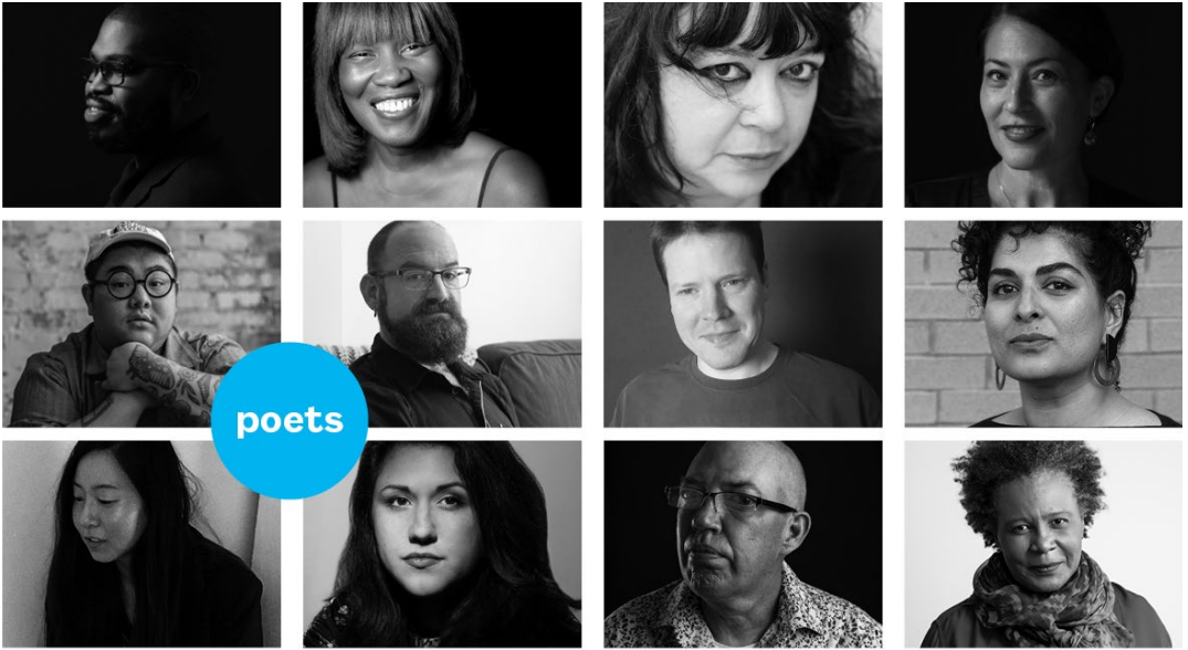
2023 Poem-a-Day Guest Editors

audience of nearly 332,000 subscribers—a 3.4% increase over the previous year. The Poets.org homepage, which prominently features our Poem-a-Day series, was visited 1,338,000 times, and the series’ landing page was visited nearly 362,000 times. The podcast, which features the audio of poets reading their poems and “about this poem” statements, as well as monthly introductions by each Guest Editor, had 935,314 downloads—up from 930,935 downloads the previous year.